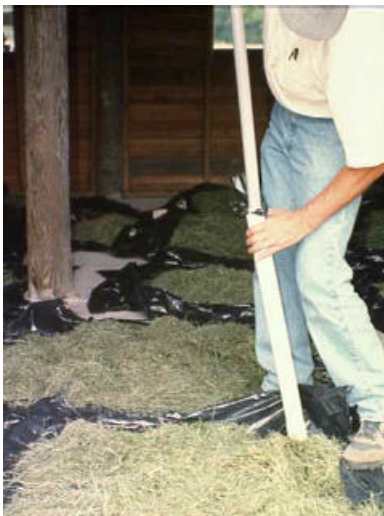
Starting Silo(plastic barrier) and packing